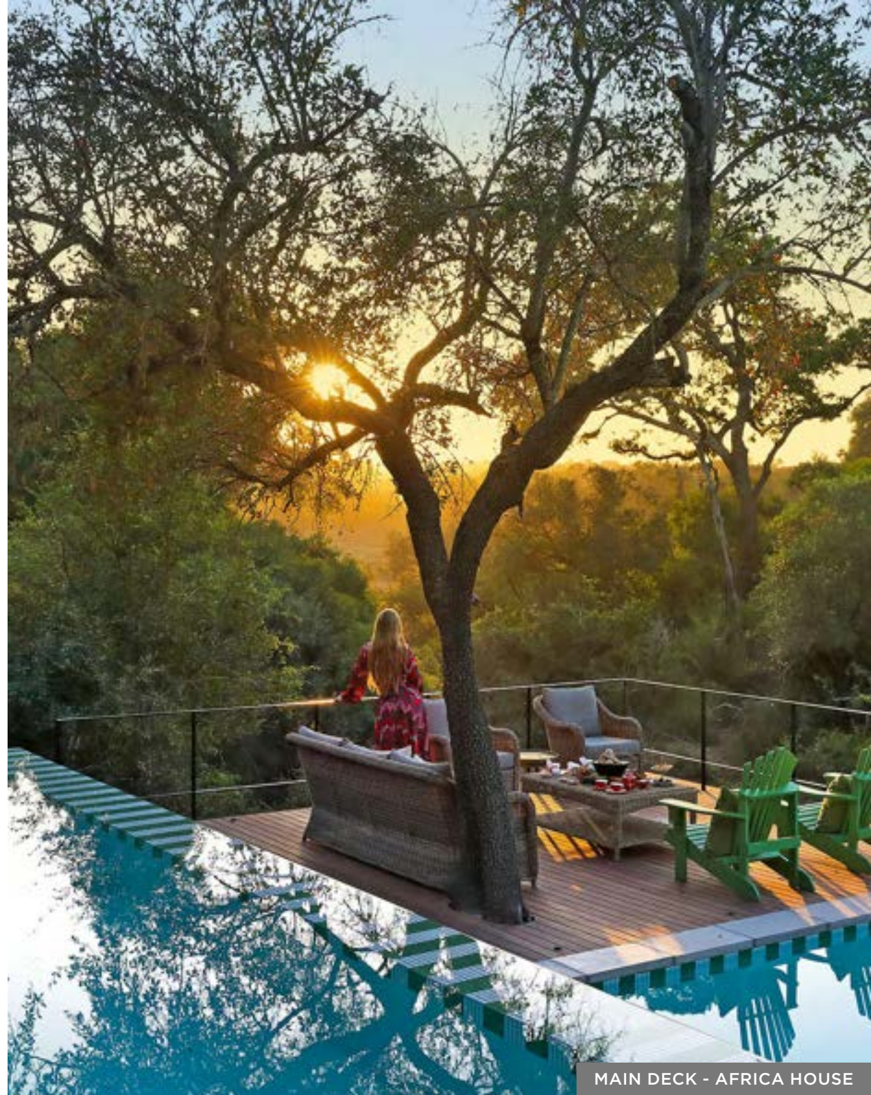
MAIN DECK - AFRICA HOUSE

Slip into the infinity pool on the main deck for the ultimate vantage point over the dry riverbed below, and watch as wildlife passes by, entirely unperturbed by your presence.